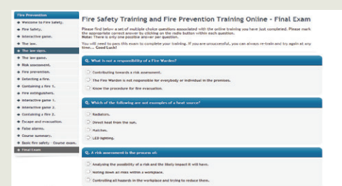
Final Exam – Certificates Provided.

Those responsible for workplaces must provide staff with suitable, sufficient and appropriate training to help prevent the outbreak of fire.